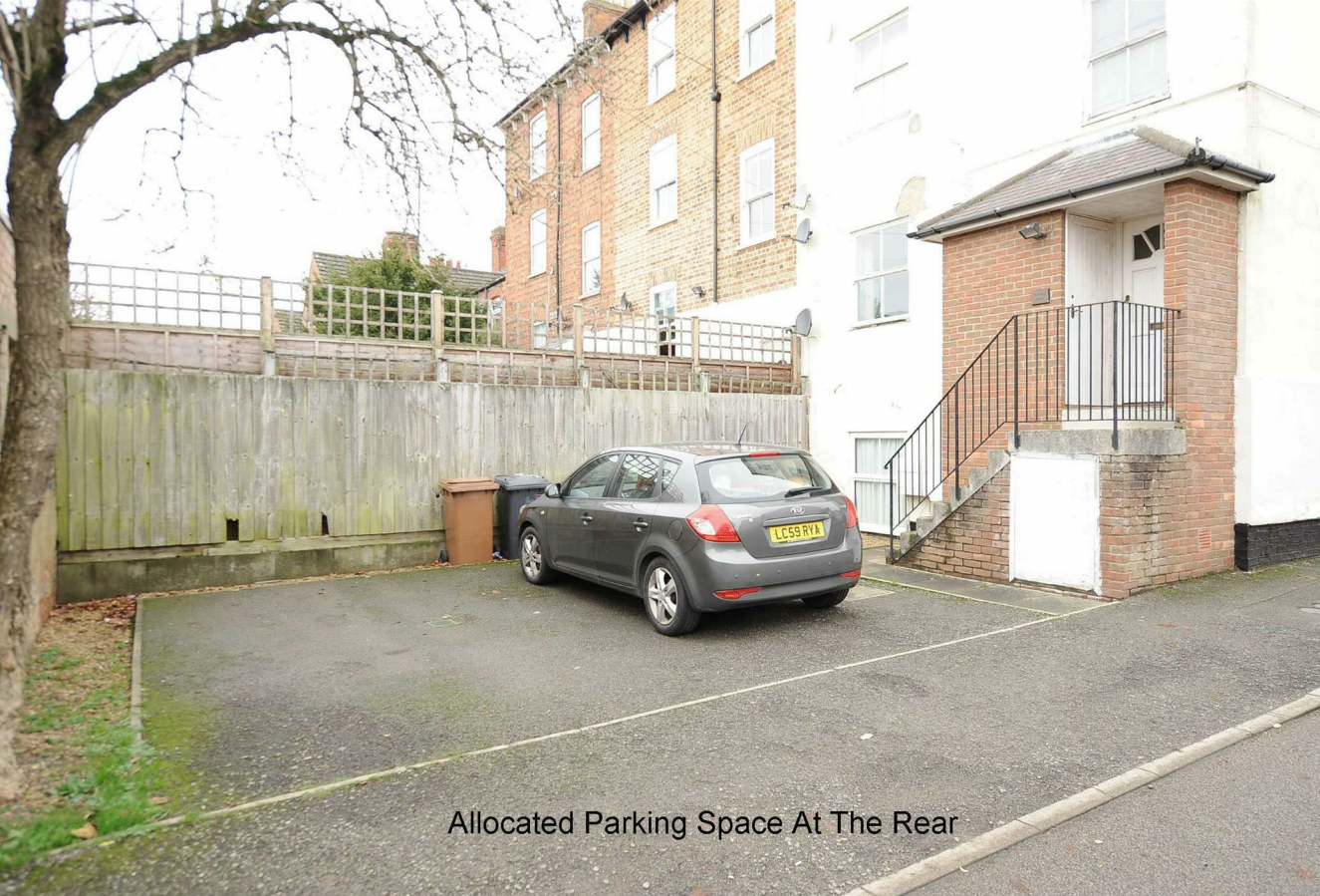
Allocated Parking Space At The Rear