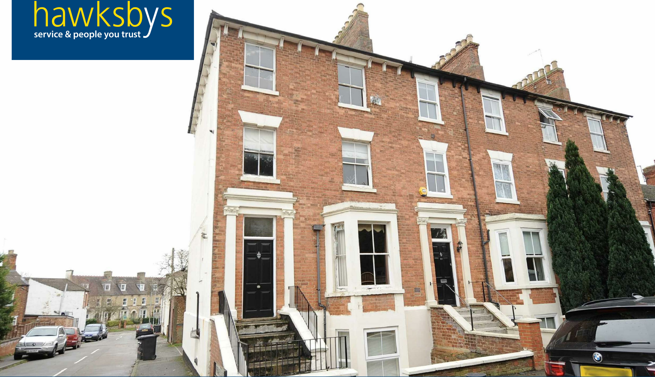
Photo Shows Whole Building

Flat 2 Redwell Mews, Wellingborough, NN8 5AX